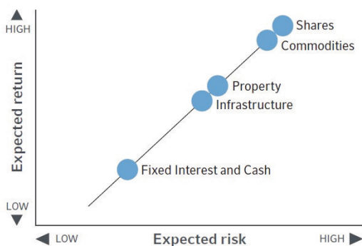
Position on risk/return spectrum